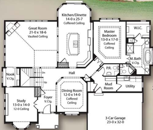
First floor 2208 square feet