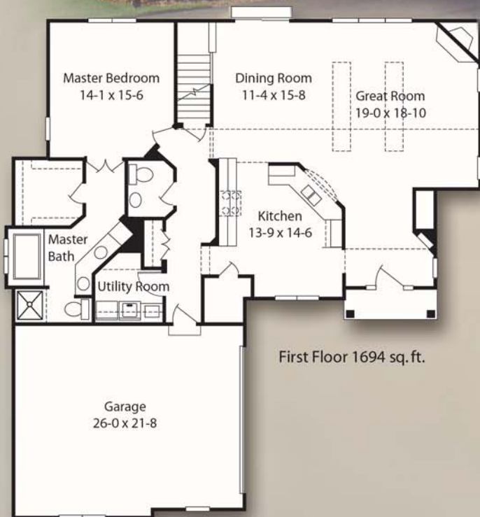
First Floor 1694 sq. ft.